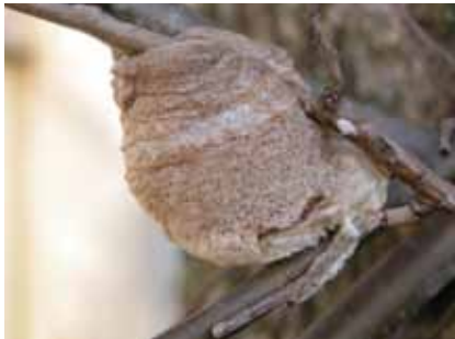
Eggs in Egg Case